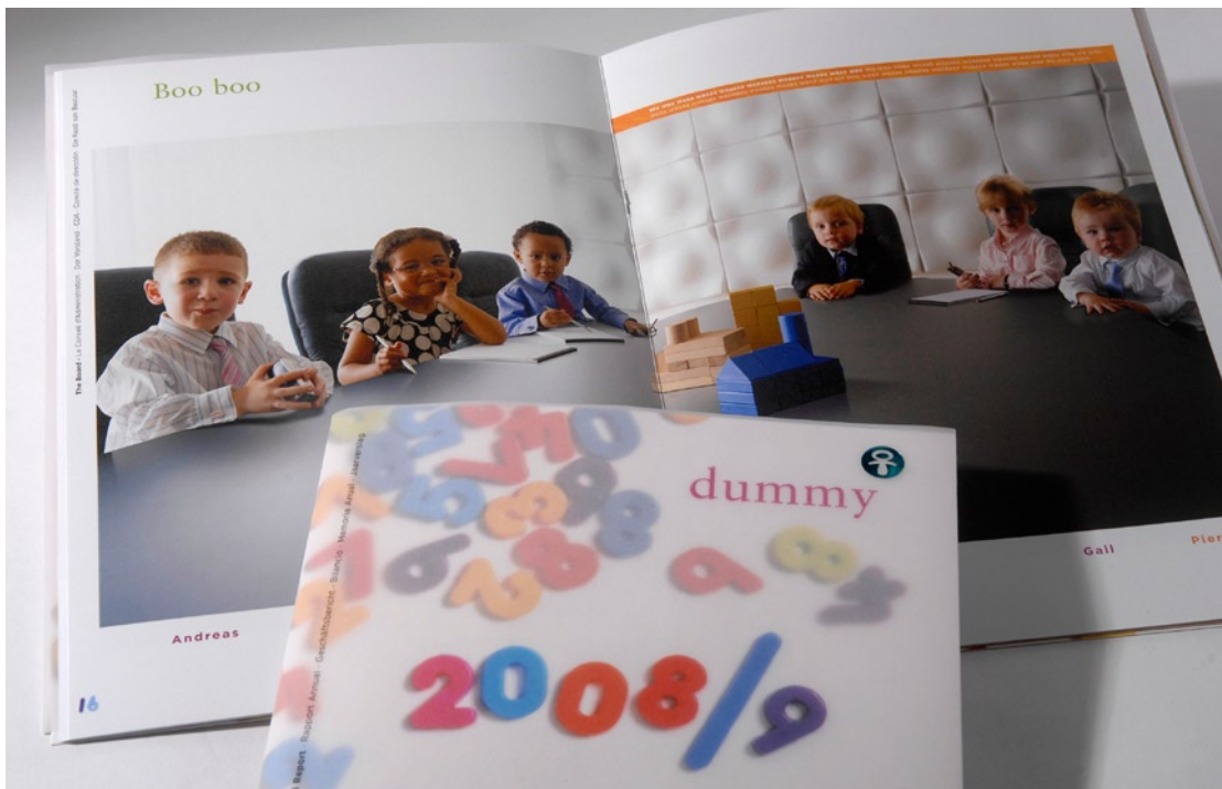
Argowiggins eye-catching mock annual report

Each of the eight paper brands used within the dummy report have achieved or are in the process of securing certification by Forest Stewardship Council (FSC). For example, the cover and a number of internal pages are printed on Conqueror, the market-leading paper brand for business and corporate communications. Conqueror was fully FSC-certified across the entire range in October when it also became Europe's first carbon neutral brand for creative papers.